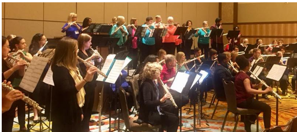
The Festive Florida Flutes, including members from the FSU Flute Choir

Thanks to its location in our home state, this NFA felt extra friendly and closer to home, both literally and figuratively. We had a terrific time and look forward to our next NFA performance!