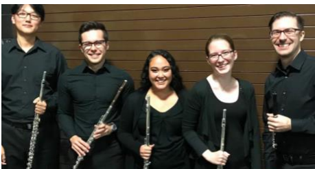
FSU Flutists after the University Wind Orchestra concert this September